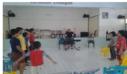
Figures 3. Training and mentoring method in breathing techniques materials.