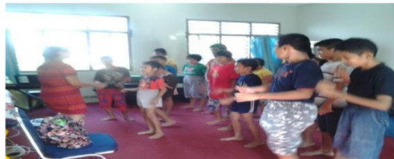
Figures 1. Research team's explanation about singing activity for the ABKs

The research team was fully aware that theory or verbal explanation given to the ABKs has to be followed by practical activities in the form of training so that the results or the objectives are good. Therefore, after giving the theory or explanation regarding the singing activity, the team then resumed with training and mentoring by the team. The theory and training materials included: (i) singing while clapping hands, (ii) learning rhythm, learning melodies, (iii) breathing technique, (iv) vocal techniques, (v) pronunciation of words in song lyric, and singing and listening to music (audio-visual).