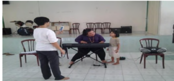
Figures 4. The ABKs' interaction during keyboard and CD tape show