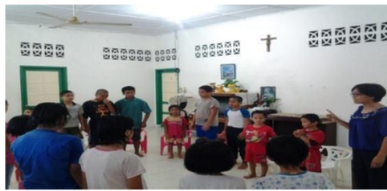
Figures 2. Playing rhythm patterns with hands-clapping in the training and mentoring methods.

Research team gained a lot of experience from the children way of singing during this research activity, and the team felt the need to develop this activity into another level of learning model in the years to come. In case of music colloquium activities, singing regional and western songs needed special colloquium. Music colloquium activities were planned to get attention and praise from the Chairman of the Foundation, the Principal and Head of the Orphanage. The team's success in the learning process was proved. The implementation of music colloquium was expected to gain satisfactory results from the ABKs. This colloquium became the symbol of success in the learning process and in the team's hard work in the implementation of teaching methods, training and mentoring activities. It can be seen in the documents of images and of video which were uploaded in the Youtube.