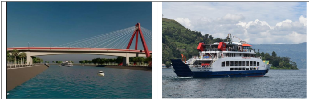
Fig. 1. Infrastructure Development in the Framework of NTSA Super Priority

As a Super Priority NTSA, tourism is expected to be a driver of regional growth, increasing welfare through the creation of business and employment opportunities, increasing local original revenue, creating added value for natural and cultural resources. To achieve this goal, various infrastructures have been, are being and will be built, including the construction of high-way to tourist destinations, airport development in the Lake Toba area, construction of roads and bridges and provision of rolling in and rolling out ferries [4]. The total budget allocated by the government for infrastructure improvement in 2020 reaches IDR 1.25 trillion. For comparison, in 2019 the total expenditures of local government of Samosir Regency were IDR 830 billion. The most prominent infrastructure development in Samosir Regency within the framework of the super priority NTSA is presented in Figure 1.